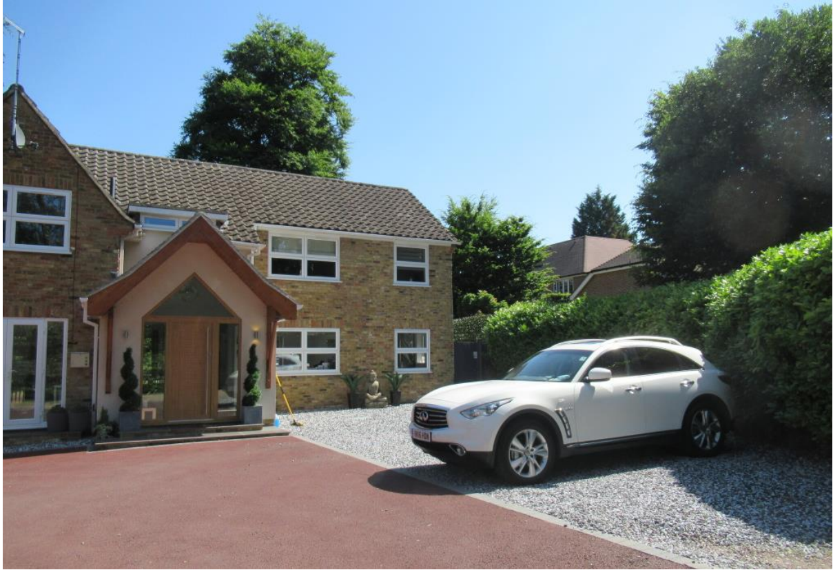
THE PROPOSAL WOULD BE OVER THE SHINGLE PARKING AREA